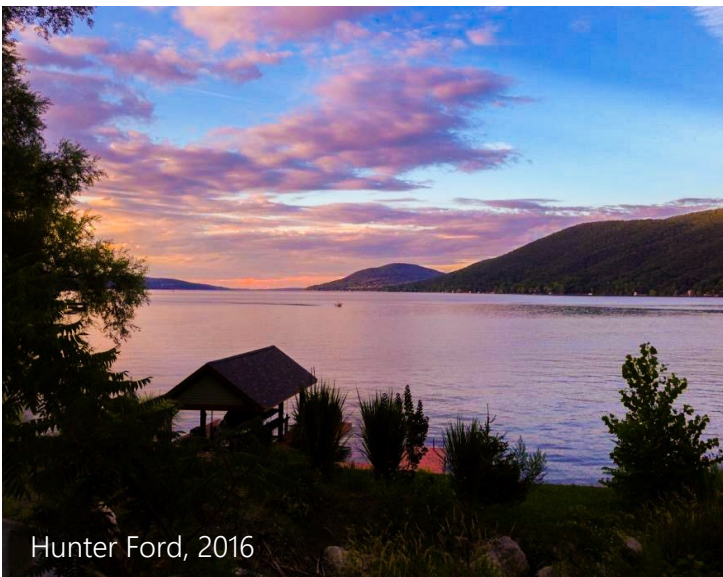
Hunter Ford, 2016

Contest is open to amateur photographers. Up to three images may be submitted. Entries will be judged by a panel of professional photographers based on degree of creativity and overall aesthetics. Prizes will be awarded at the CLWA Annual Meeting in August.